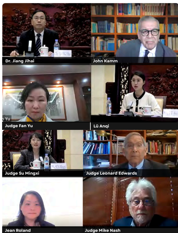
Above: Panelists of the “Topics in Juvenile Justice Reform” webinar on April 13, 2023.