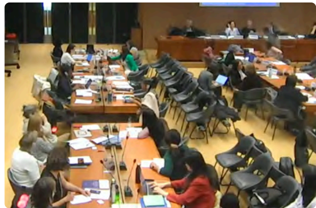
Above: 197th Meeting, 85th Session, CEDAW on May 8, 2023.

During 2023, Dui Hua remained in frequent communication with Special Procedures of the Human Rights Council, providing information and advice to rapporteurs and treaty bodies, including those planning visits to China.