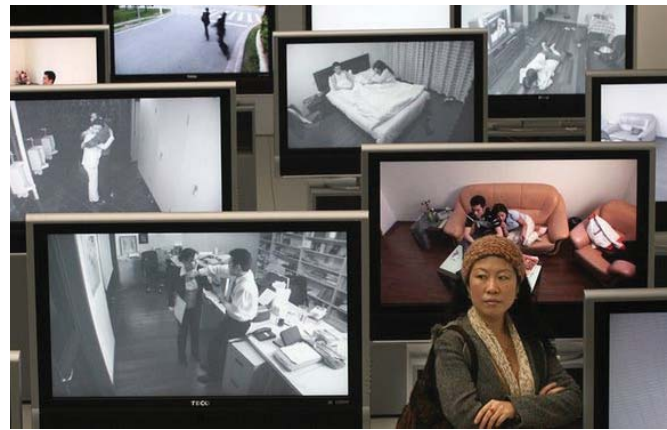
A woman stands near videos from an exhibition on domestic violence in China.

health disorders, substance abuse, and are more likely to serve time for non-violent crimes than their male counterparts. The connection between targeted non-custodial measures that include mental health treatment, addiction recovery, and family support and the reduction in recidivism is well established in empirical research. ■