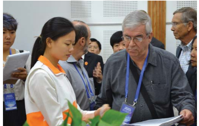
Social workers demonstrate record sealing protocol at the Social Worker Center.

The American delegates were then received at the Shenzhen Intermediate People's Court where they participated in a roundtable discussion on juvenile justice reform in Shenzhen with a group of senior court officials. Owing to Shenzhen's large migrant worker population, more than 90 percent of delinquents who come before Shenzhen's juvenile courts are from outside Shenzhen. Shenzhen juvenile judges introduced the concept of "social worker stations" located inside courts that are staffed by social workers trained in providing youth psychological examinations. However, members of the Chinese delegation also expressed the view that more work