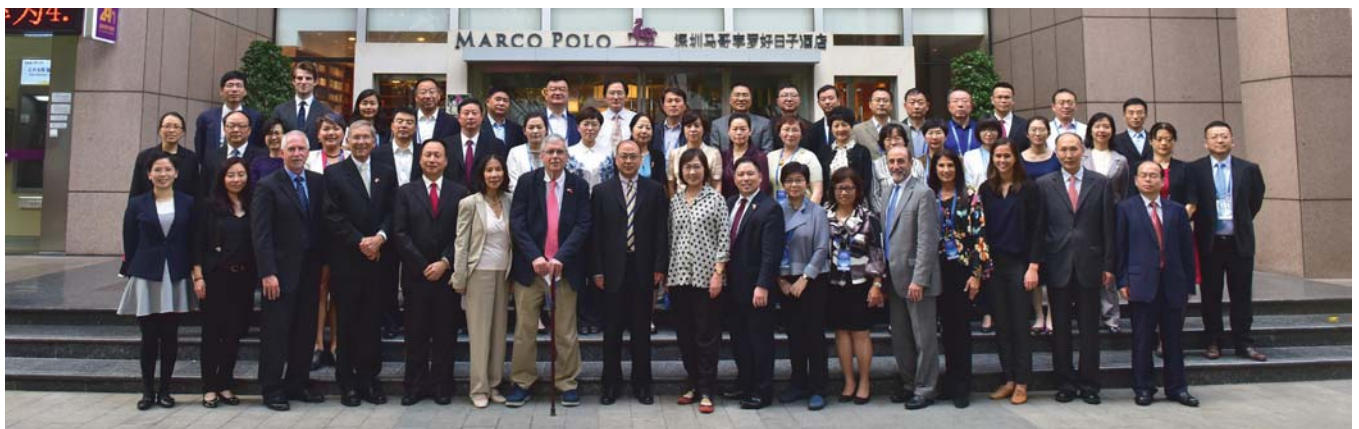
Delegation members of the 2017 US-China Juvenile Trial System Reform Seminar.

In his concluding remarks at the exchange, Judge Jiang Ming of the SPC praised the exchange for its enhancement of mutual trust and for the sincere, engaging, and in-depth exchange of ideas . The success of the exchange was owed to the American and Chinese participants' shared belief in the importance, as well as their roles, in fostering a rehabilitative over a punitive juvenile justice system. The SPC is committed to continuing the momentum built on this program and to planning another juvenile justice exchange with Dui Hua. ■