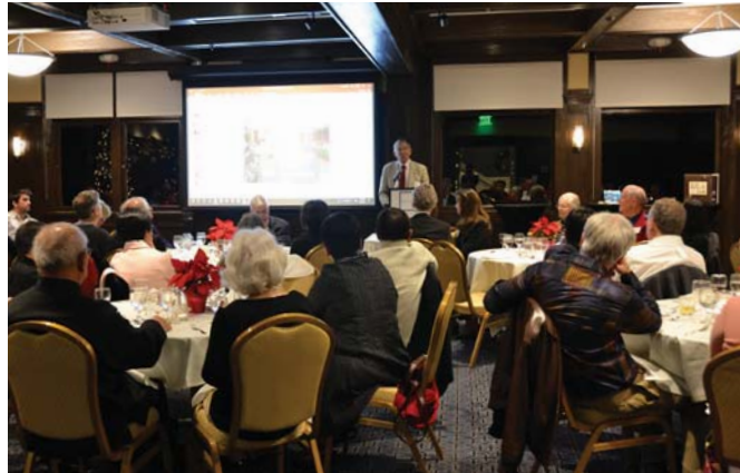
Judge Leonard Edwards gives a special presentation to Dui Hua’s local supporters at the annual holiday celebration.

the lawyers detained during the “709” crackdown in 2015. In December, Dui Hua supporters gathered in San Francisco for the foundation’s Annual Friends of Dui Hua holiday reception to celebrate the success of Dui Hua’s fifth juvenile justice exchange. Honorable guests included members of the American delegation to the exchange. Judge Leonard Edwards, who led the American delegation, briefed guests with a special presentation on the exchange. ■